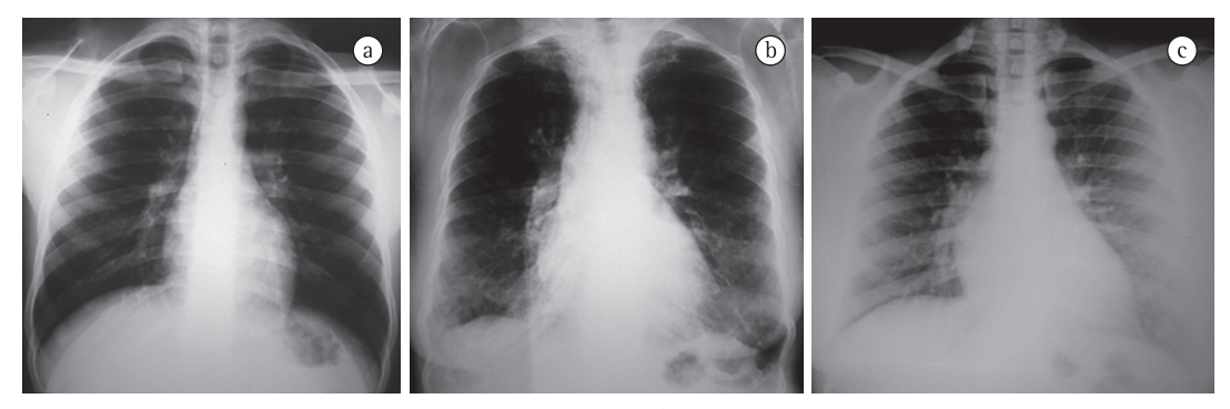
Figure 2 - Chest X-rays of non-tuberculosis patients. In a), a 21-year-old male, dry cough for the last three weeks after a common cold. In b), a 72-year-old female, productive cough for the last 10 years and recent worsening of health status. In c), a 36-year-old female, dull dorsal thoracic pain and dry cough for the last four weeks.

The distribution of the choices made by the medical students regarding the individual chest X-rays was evaluated. In addition, the proportions of their choices toward an appropriate clinical approach based on the history and the chest X-ray of each patient were computed. The group was also split into high scorers (5-6 correct answers) and low scorers (all other scores) in an attempt to determine the factors that could be associated with a higher score in the interpretation of chest X-rays, using Pearson's chi-square test. The sensitivity and specificity of the