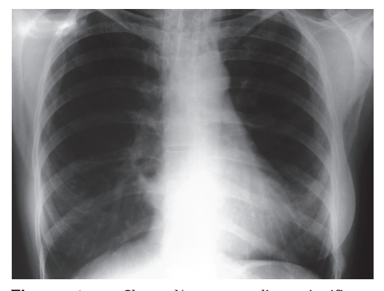
Figure 4 - Chest X-ray revealing significant improvement after the completion of tuberculosis treatment with regimen 1.

to methotrexate: two humanized monoclonal antibodies-infliximab and adalimumab-and a fusion protein composed of two TNF p75 units hybridized to the Fc portion of human lgG1, which acts as a competitive TNF inhibitoretanercept.<sup>(9)</sup> These three agents have been proven to be effective and safe in patients with initial or established disease, improving quality of life and minimizing the progression of radiological damage.<sup>(10,11)</sup> However, since the beginning of the use of anti-TNF- \alpha , hundreds of cases of pulmonary tuberculosis and extrapulmonary tuberculosis have been reported in patients receiving such treatment. In a survey of all cases reported to the Food and Drug Administration up to May of 2001, it was observed that, among