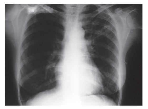
Figure 1 – Chest X-ray revealing alveolar opacity with apparent cavitation in the left upper lobe.

peripheral polyarthritis, which leads to deformity and destruction of the joints due to bone and cartilage erosion. Wrists, fingers, toes, knees and feet are most commonly affected. In addition, nonspecific constitutional symptoms, such as fatigue, nonrestorative sleep and weight loss, can occur.<sup>(5-7)</sup> The principal alterations in the synovial membrane of such patients are as follows: hyperplasia; vascular alterations, including microvascular injury, thrombosis and neovascularization; edema; and inflammatory cell infiltrate composed primarily of CD4+ T cells. Antigen-activated CD4+ T cells stimulate monocytes, macrophages and synovial fibroblasts to produce the cytokines IL-1, IL-6 and TNF- \alpha , as well as to secrete metalloproteinases, through the surface markers CD69 and CD11 and through the release of soluble mediators, such as