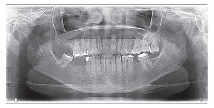
FIGURE 2 – Panoramic radiograph with absence of radiographic changes in the region of the lesion

At histopathologic examination, a lesion characterized by proliferation of epidermoid, intermediate and mucous cells was observed, surrounded by a stroma of fibrous connective tissue of varying density. Those cells were arranged in some regions, sometimes in a solid pattern, sometimes forming cystic structures of variable size, with the presence of an amorphous eosinophilic material compatible with mucus inside them, besides the formation of mucin pools. Cellular atypia was not seen; just some neoplastic cells with slight pleomorphism and hyperchromatism ( Figure 3 ).