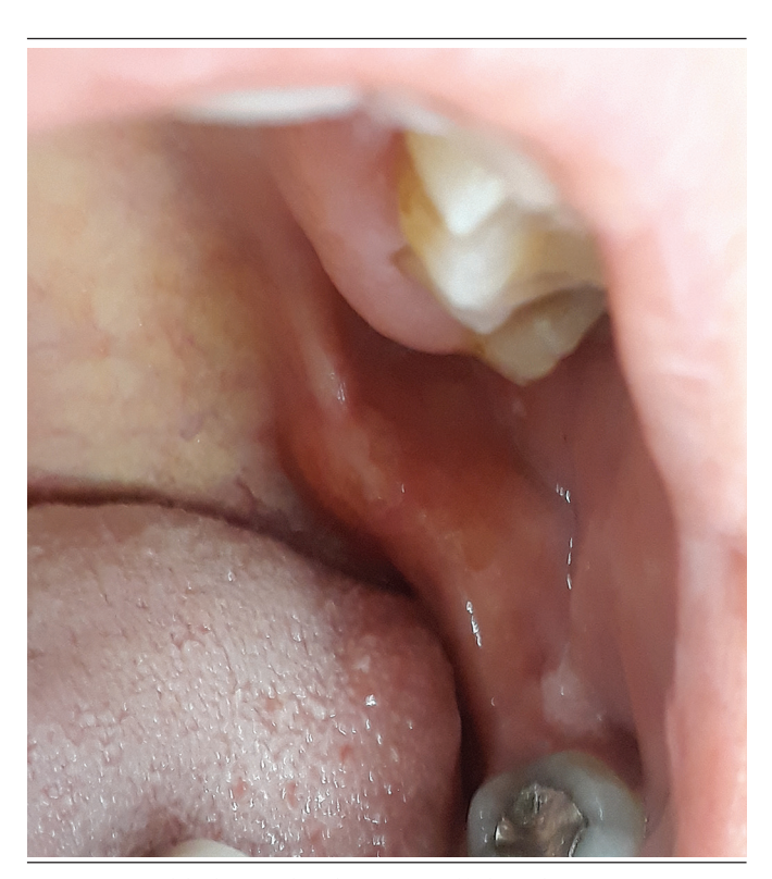
FIGURE 1 - Nodular lesion in the right pterygomandibular raphe region

A panoramic radiograph was ordered to evaluate the possible lesion-associated bone loss; however, radiographic changes were not identified ( Figure 2 ). Preoperative tests were also requested for the conduction of the excisional biopsy of the lesion. The diagnostic hypotheses were salivary gland lesion and sialadenitis.