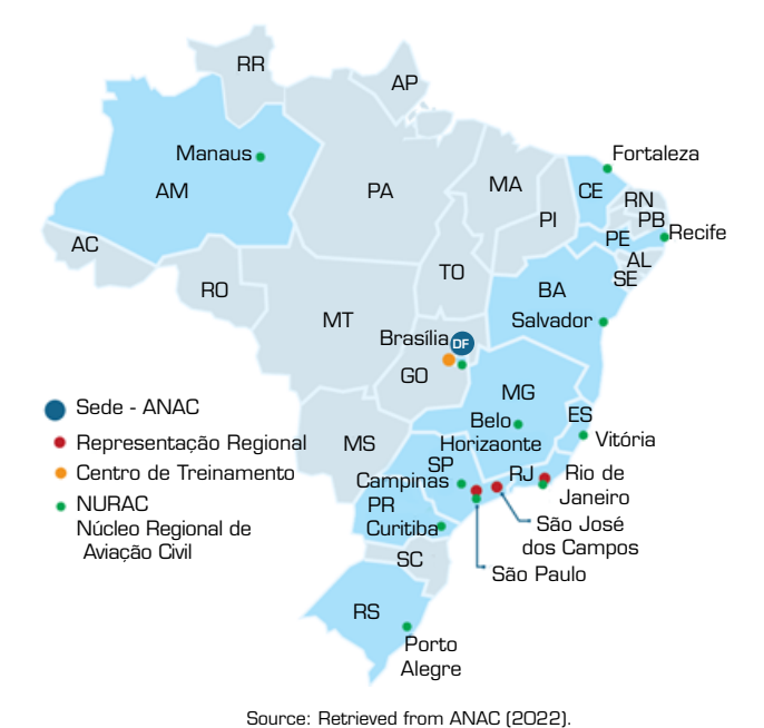
Figure 5. ANAC's units in Brazil.

The scope of ABIN's activities, not to mention several other SISBIN bodies, has the potential to promote diversified situational awareness, contextualizing national and international topics of interest to Civil Aviation security.