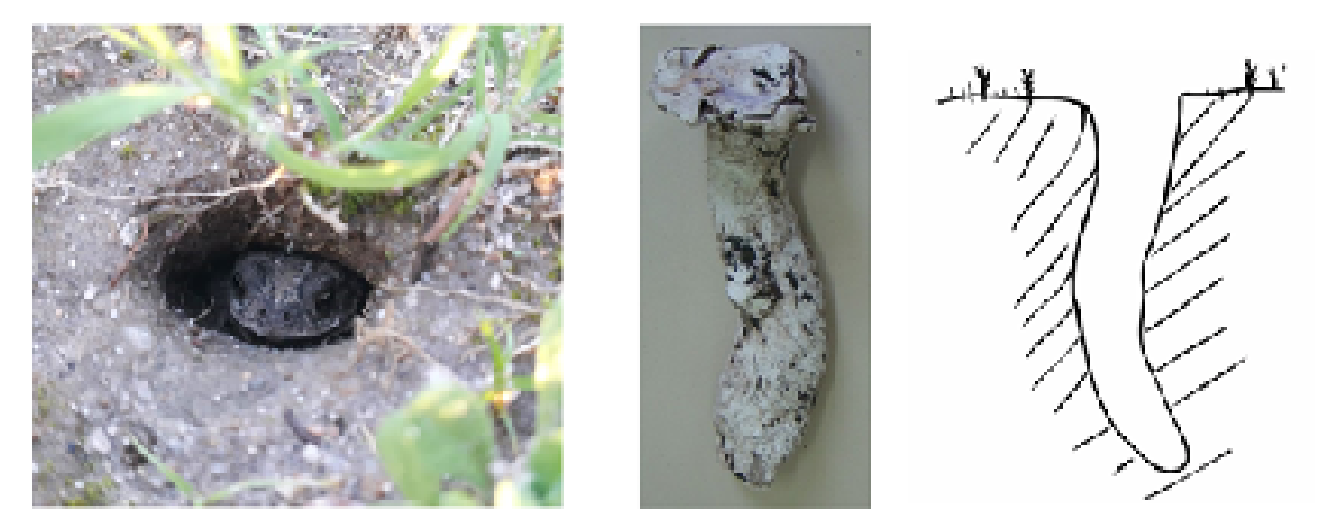
Fig. 2. Characterization of the shape of the Rhinella dorbignyi (Duméril & Bibron, 1841) burrow opening, three-dimensional model in plaster of the burrow and the representation of a longitudinal view of the excavation that forms the burrow.

linear measurements were made by an electronic caliper with a precision of 0.01 mm. To obtain the total volume of the model, we submerged it into a graduated container filled with water and measured the displacement of the liquid.