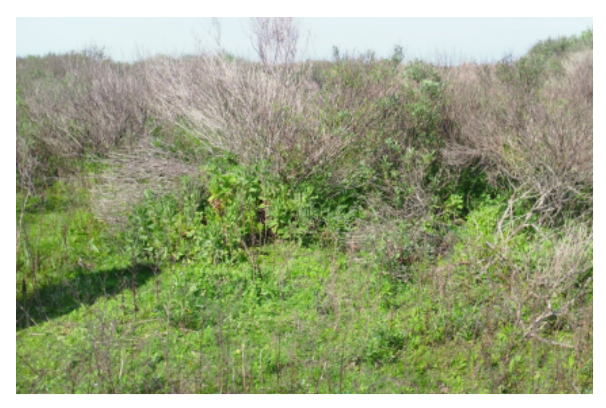
Fig. 1. Representation of the vegetation cover from Taim Ecological Station (ESEC Taim), a federal protected area and Ramsar site in Brazil's extreme south. In the first plain, a grassy microhabitat (where we can find Rhinella dorbigbyi 's burrows), and a shrub area in the back (Photo: A. M. Tozetti).

Four people searched for the toads' burrows during daytime via visual search. We only sampled burrows with indications that they were being used until recently by the toads (without signs of dryness or spiders inside). When a burrow was detected, its interior was inspected with the aid of a flashlight to check for the presence of the "resident" amphibian. Recently abandoned burrows that were not currently occupied by a toad were used to build threedimensional casts to characterize the internal design. To minimize the stress of animals, only burrows without toads were modeled. To create the models, we diluted Plaster of Paris in water until it acquired a pasty consistency. Afterward, the mixture was poured into the opening of the hole until filling it. After 20 minutes, the model was hard enough to be removed (Fig. 2). To describe the internal design of the burrows, we performed the following measurements from models: chamber length, straight from the top to the bottom of the cast; maximum channel diameter, and minimum channel diameter, measured in the burrow opening. The