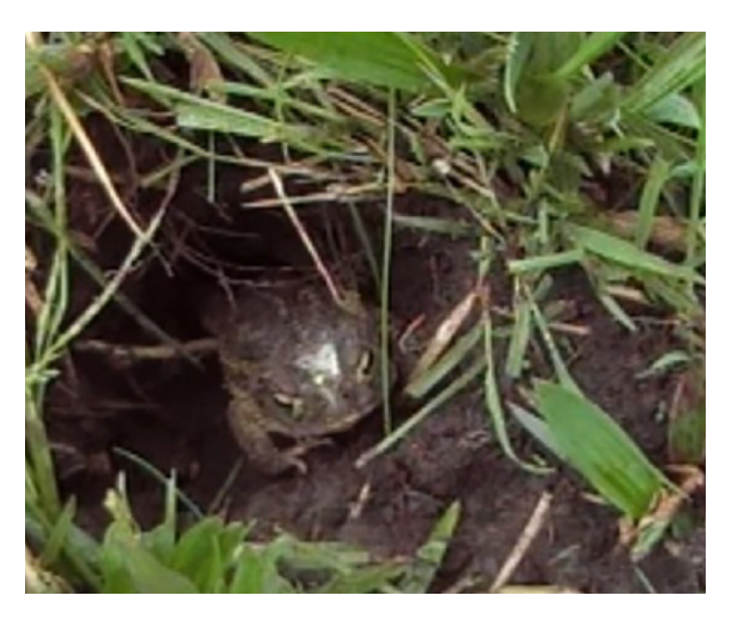
Video A1. Rhinela dorbignyi using its burrow at the study site. Link: https:// youtu.be/iBmci3LLCXE