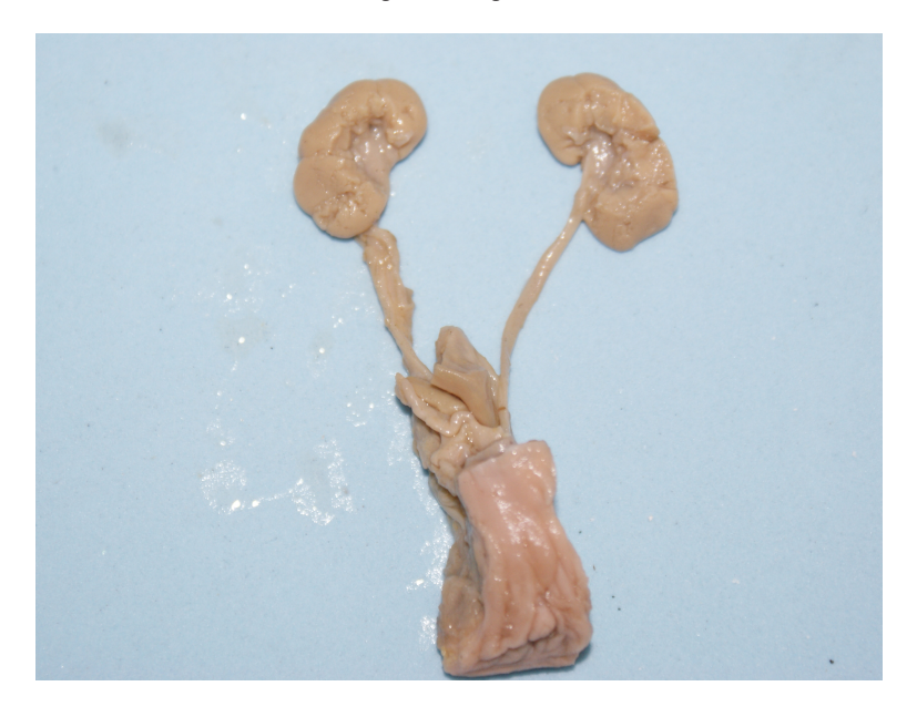
Figure 1 - The fetuses were carefully dissected with the aid of a stereoscopic lens with 16/25X magnification and the kidneys were removed together with the ureters, bladder and genital organs before the measurements of renal volumes.

The fetal renal volume was calculated using the ellipsoid formula (10): Renal volume