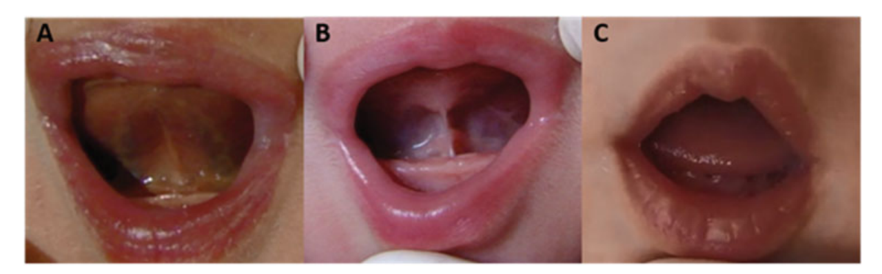
Fig. 3 Tongue position at rest. In A, elevated, in B, elevated, but being pulled down by the lingual frenulum, and in C, down-positioned in the oral cavity.

Of the 334 infants included in the present study, 130 (38.92%) were females and 204 (61.08%) were males. Out of the total sample, 243 (72.75%) underwent lingual frenotomy, being 101 (41.56%) females and 142 (58.44%) males. Of the 91 infants (27.25%) who did not undergo the surgical procedure, 29 (31.87%) were females and 62 (68.13%) were males.