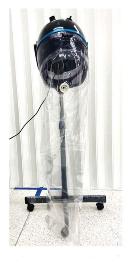
Fig. 1 The "endoscopy salon" was created with a hooded hair dryer, a 24 \times 34 -inch plastic sheath, and a silicone nipple. The plastic sheath was attached at the bottom of the hood of the hair dryer. The silicone nipple was inserted and attached through the plastic sheath as a port for nasal endoscopy and fiber optic laryngoscopy.

The hooded salon hair dryer was modified with the attachment of a plastic sheath of about 60 \times 85 cm and a silicone nipple (>Fig. 1). This modified device was developed with the aim to serve as the barrier for respiratory droplet transmission between patients and healthcare providers (►Fig. 2).