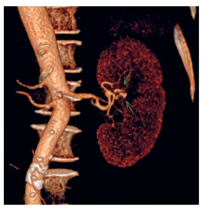
Figure 4. An aneurysm involving the anterior segmental branch of the left renal artery, showing a virtually complete thrombosis (three-dimensional reconstruction)