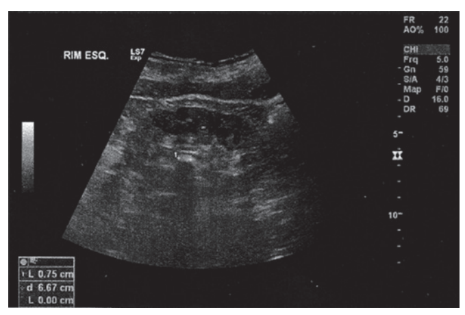
Figure 1. Ultrasonography suggestive of renal calculus of approximately 7.5mm in the middle third of the left kidney

Faced with the unexpected finding, and diagnosis of urinary calculus ruled out, she was referred to a vascular surgeon. Renal artery computed tomography angiography showed that the right kidney was supplied by two arterial branches of similar caliber, patent throughout, without stenosis or aneurysm. The left kidney was supplied by a single arterial branch, with a prominent aneurysm involving the anterior segment branch, showing almost complete thrombosis, measuring 12mm x 9mm in diameter (Figure 4). The diameter of the renal artery adjacent to the aneurysm was 5mm.