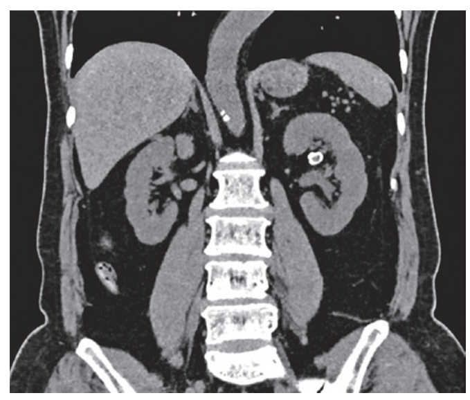
Figure 3. Computed tomography scan showing a saccular aneurysm with parietal calcification of the left renal artery on the plane of the renal hilum, measuring 1.0 \text{cm} \times 1.0 \text{cm} (coronal plane)

This study was approved by the Research Ethics Committee of Faculdade de Medicina do ABC under # 4.440.144, CAAE: 34350420.6.0000.0082.