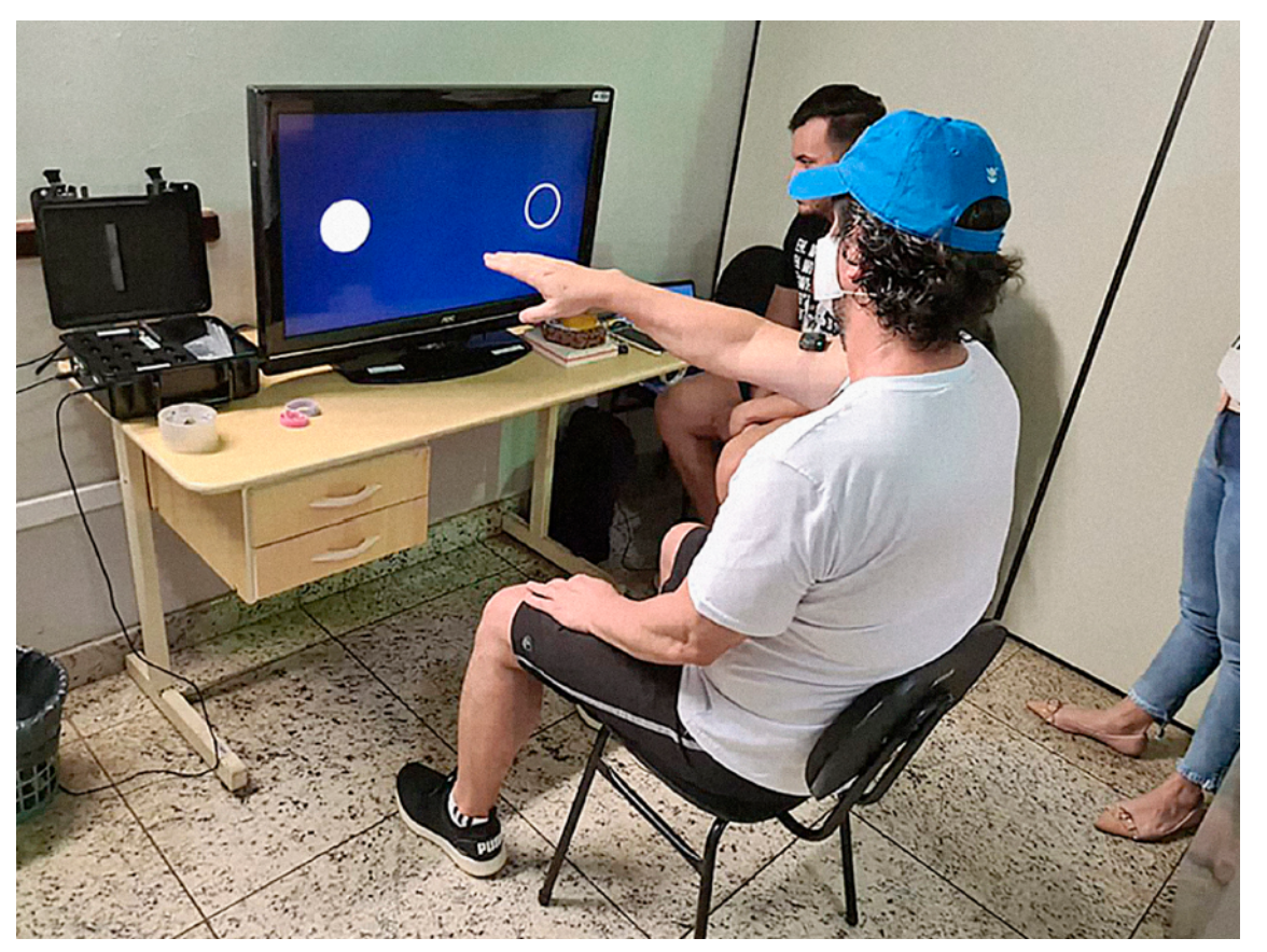
Figure 1. Participant's position and choice reaction time evaluation.

CRTs were evaluated using electromyographic (EMG) signals according to stimulus onset in the anterior deltoid, brachial biceps, and triceps of the upper limbs. EMG signals were recorded using a Delsys Trigno<sup>™</sup> wireless telemetry sensor at 2,000Hz according to the SENIAM protocol (surface EMG for noninvasive assessment of muscles)<sup>21</sup>. The EMG electrode sites were shaved and cleaned with alcohol. EMG onset latency was defined as the time when the EMG amplitude exceeded