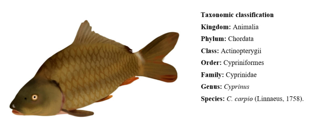
Figure 4. Drawing of Cyprinus carpio (Linnaeus, 1758) and its taxonomic classification. Illustration by Lucas R. F. Santos.