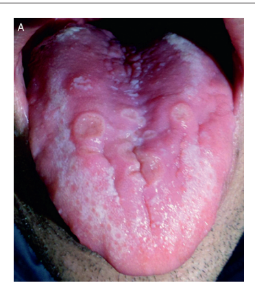
Fig. 1 – Asymptomatic ulcerated lesions in the tongue.

Article history: Received 1 June 2013 Accepted 7 June 2013 Available online 23 October 2013