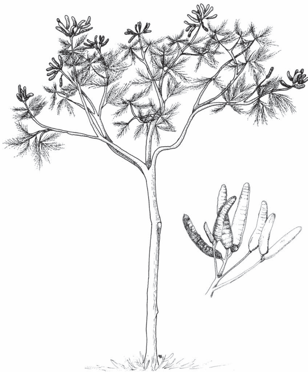
Fig. 1 — Reproductive individual of Dimorphandra mollis in detail, ripe (dark) and unripe (clear) fruits.