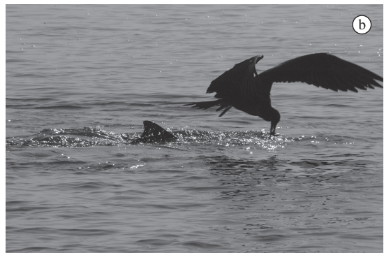
Figure 2. Frigate bird ( Fregata magnificens ) capturing a fish close to the water surface during a fish bout displayed by a Guiana dolphin ( Sotalia guianensis ) in the Lagamar estuary.