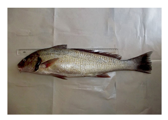
Figure 2. Umbrina cirrosa with 68.8 cm TL and 2600.00 g TW from Bay of Saros.

Koutrakis and Tsikliras (2003) sampled nine specimens by using various fishing gear (beach-seine, fyke-net, gill nets) in Porto-Lagos lagoon (Northern Aegean Sea, Greece). They stated that the length range of the species was 6.5-24.7 cm (TL). Nevertheless, Froese and Pauly (2019) expressed the maximum size was 73.0 cm (TL) and maximum weight was 3100.00 kg.