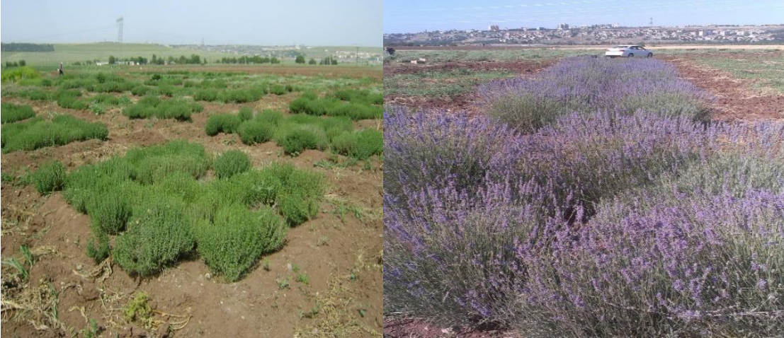
Figure 1. T. spicata