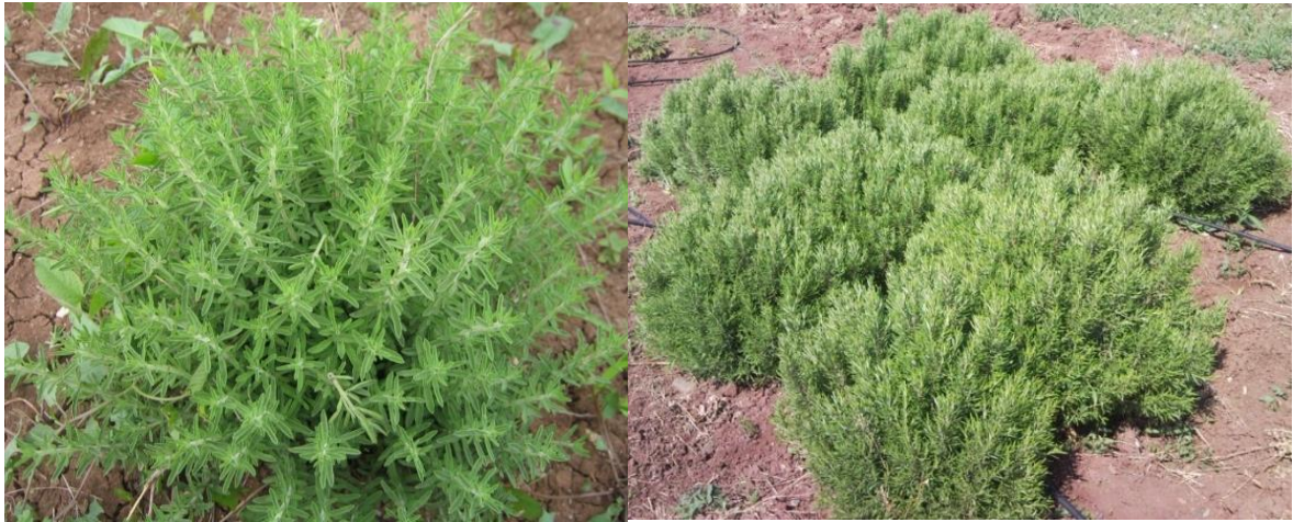
Figure 3. S. macrantha

The genus Satureja is representing by 16 species and 17 taxa [26]. The essential oil obtained from the leaves of this genus is used in the treatment of some diseases such as diarrhea, wounds, gastroenteritis and upper respiratory and urinary tract infections [27]. R. officinalis is an economically important plant that grows naturally mainly in the Mediterranean region. Essential oil derived from rosemary is widely used in cosmetics, sweetening and preserving food products. It also has anti-inflammatory, chemo preventive, anti-cancer, anti-proliferative, antimicrobial activities [28].