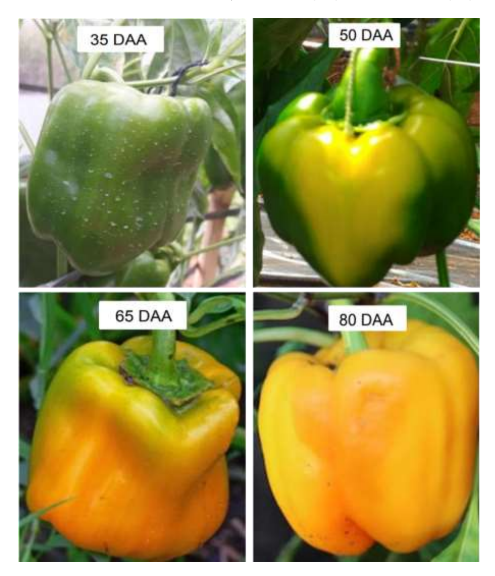
Figure 1. Visual aspects of sweet pepper fruit at maturation stage (35, 50, 65 and 80 days after anthesis).

To determine the maturation period, all flowers of all plants were marked on the day of their anthesis. The harvests were performed when the fruits had the maturity stage corresponding to 35, 50, 65 and 80 days after anthesis, based on fruit coloring and crop cycle, (Figure 1) and half of the fruits had their seeds extracted on the day of harvesting (without rest) and the other half remained at post-harvest resting on laboratory bench (40% RH and 20°C). At harvest time the visual appearance of the fruits was: fully green fruits at 35 DAA; fruits with transient coloration from green to yellow at 50 DAA; fruits with 75% bright yellow color at 65 DAA and at 80 DAA the fruits were 100% yellow, but opaque and with less pulp firmness.