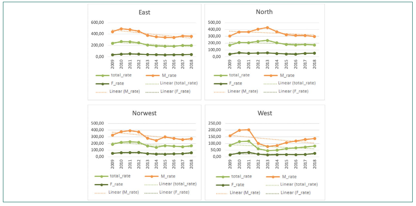
F - female; M - male

Figure 2. Rate of hospitalizations due to alcohol and other drugs and respective trend models according to sex and health macroregion