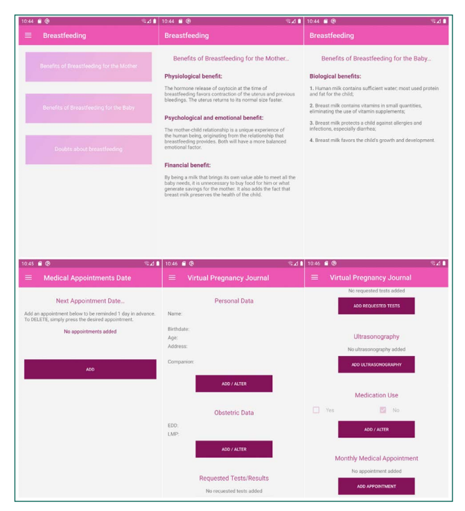
Figure 3. Graphical representation of the screens of the Gestação Saudável application

partum depression. As for newborns, it reinforces information about growth and development consultations, hygiene, cleaning the umbilical stump, neonatal screening tests and vaccines.