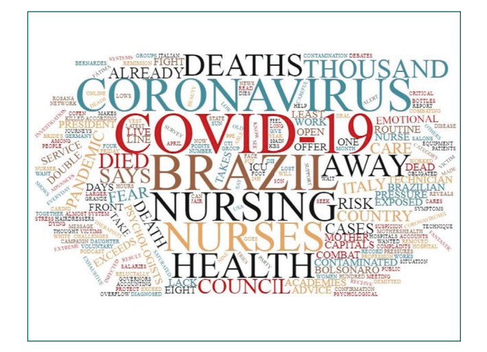
Figure 3. Word cloud representative of Category 3 Vulnerability, Illness and Death of Nursing Professionals