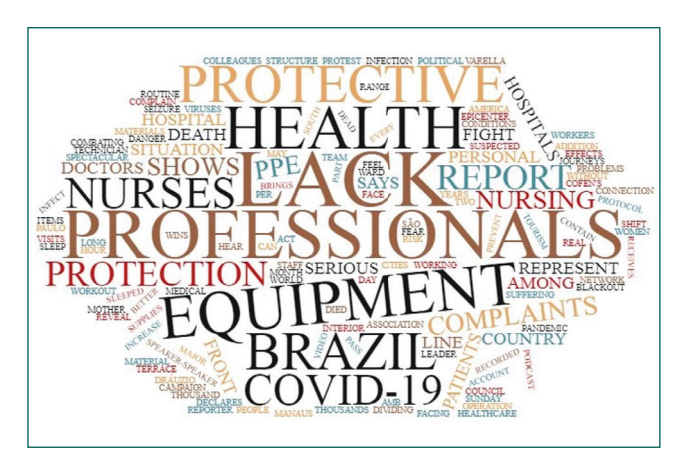
Figure 2. Word cloud representative of Category 2 Working Conditions of Nursing Professionals

The coverage of deaths and absence from work of contaminated Nursing professionals continues to grow between April and May, and a deeper approach becomes more frequent, addressing aspects such as the availability of PPE, fears and desires, the possibility of contamination and exposure of family members, conflicts in working hours and issues related to the socioeconomic demands of these professionals. There is also the dissemination of other initiatives, such as the solidarity of Nursing that offers qualified care aimed at professionals working at the forefront of combating the pandemic.