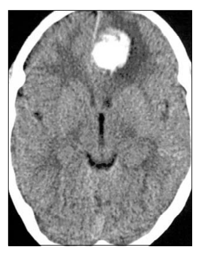
Fig 4. CT scan demonstrates a left fron tal round hematoma, with surround ing vasogenic edema.

fourteen days after the first CT scan, respectively).