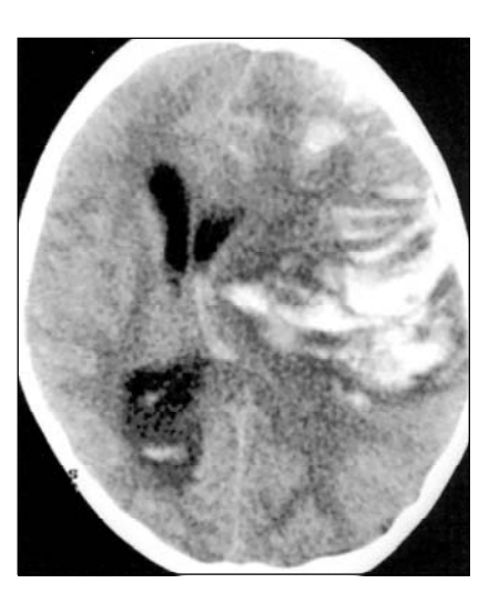
Fig 2. CT scan demonstrates a large illdefined hematoma in left frontal and temporal lobes, with extension into the ventricles and severe midline shift.