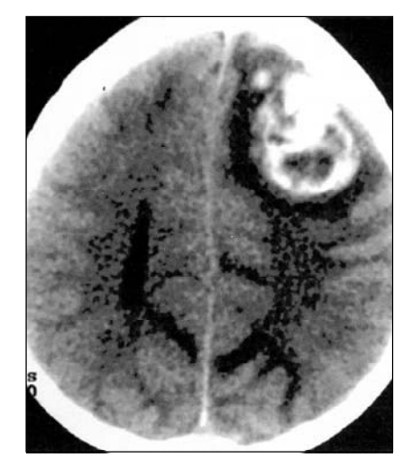
Fig 3. CT scan shows a well-defined het e rogeneous hemorrhage in the left fron tal lobe, with adjacent vasogenic edema.