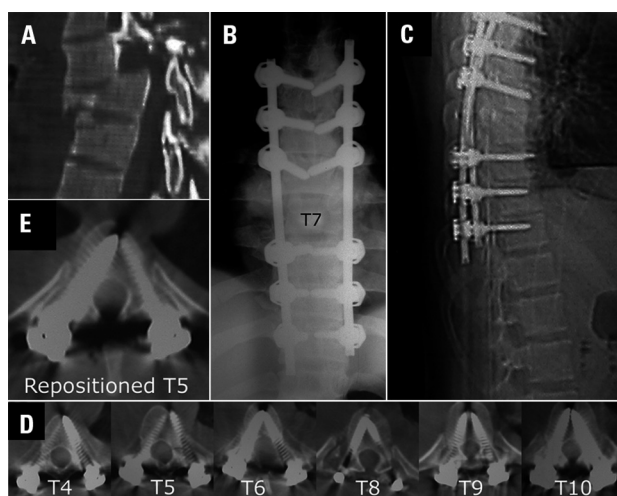
Fig 2. Images of patient #27: this 32-year-old male sustained a T6-T7 fracture-dislocation. [A] Preoperative CT scan showing a T6-T7 fracture-dislocation with marked anterolisthesis and kyphotic deformity. [B] Postoperative X ray showing good coronal alignment and good screw positioning. [C] Postoperative X ray showing good sagittal alignment and good screw positioning. [D] Postoperative CT scans confirming optimal placement of pedicle screws at all levels instrumented, from T4-T6 and T8-T10, with the exception of the left T5 screw, which perforated the anterolateral cortex and put the aorta at risk. [E] CT scan after repositioning of left T5 screw showing adequate placement.

and a vertical line passing 3 mm medial to the lateral border of the superior facet. A pedicle probe was carefully advanced under fluoroscopic guidance in the straight-forward or anatomical trajectory 16 . At least 80% of the vertebral body was cannulated using the pedicle probe so as to place the longest screw possible, taking care not to perforate the anterior cortex. In all cases we only used lateral