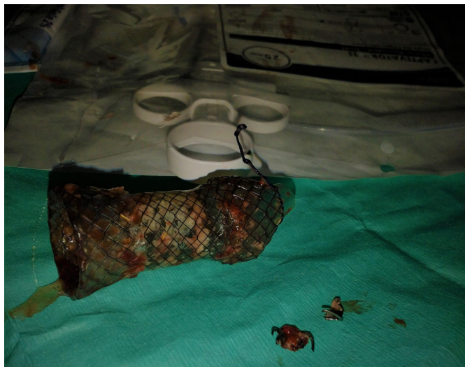
FIGURE 3. Using the over-the-scope clip clip cutter remOVE system, the over-the-scope clip stentfix was split in two fragments, allowing the removal of the stent.

The OTSC is an endoscopic device used for several purposes, including prevention of stent migration (1) . Endoscopic methods for its removal have different success rates and associated adverse events (2) . The remOVE system is effective and easy to use, allowing safe removal of OTSC (3) .