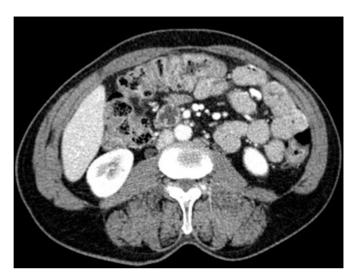
Figure 3. Abdominal CT undertaken after 10 months of antibiotic therapy, showing resolution of the inflammatory process.

first biopsy did not reach the lesion and the diagnosis of well-differentiated liposarcoma relied mostly on the positivity of the IHC reaction for MDM2, which was further ascertained a false positive result.