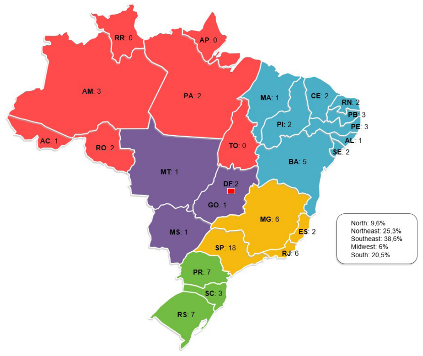
Figure 2. Distribution of Speech, language and hearing sciences courses by Brazilian states