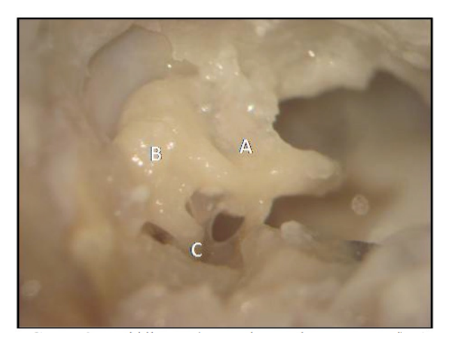
FIGURE 2 – Middle ear (tympanic membrane removed): A. Malleus; B. Incus; C. Stapes.

The floor of the cavity is similar to a honeycomb with a group of aired cells inside the tympanic bulla.