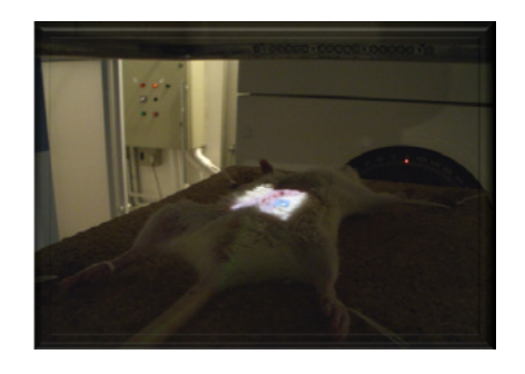
FIGURE 1 – Irradiation field illuminated.

The anesthetic procedure used ketamine hydrochloride (Ketalar®) at a dose of 10 mg/kg and the sedative, analgesic and muscle relaxant 2-(2,6-xylidine)-5,6-dihydro-4H-1,3-thiazine hydrochloride (Rompun®) at a dose of 0.1 mg/kg, and was uniform to all the animals. After anesthesia, irradiation was administered with the animal in a supine position. The field to be irradiated was determined at a distance of at least 50 mm from the genitalia, by means of illuminating the area (Figure 1).