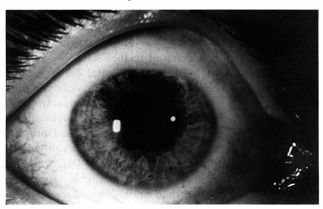
Figura 1- Fotografia do olho direito, demonstrando área de hipoplasia do mesoderma iriano superiormente e ao redor da pupila.

Humphrey computerized visual field testing showed central islands in both eyes, with a more advanced stage of loss in the left eye. Fluorescein