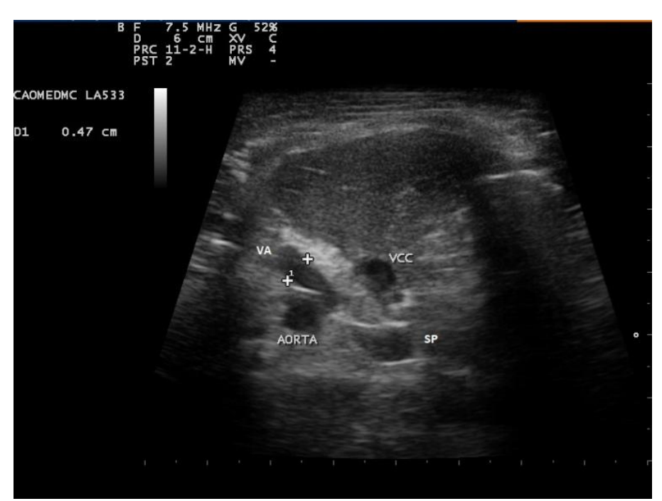
Figure 2. Ultrasound image of dog, Yorkshire, 8 months old. Transverse section at the region of hepatic hilum by intercostal access in the 10th intercostal space. Presence of anomalous vessel compatible with shunt (SP) and dilated azygos vein (VA - cursors) following towards the diaphragm. 211x172mm (96 x 96DPI).