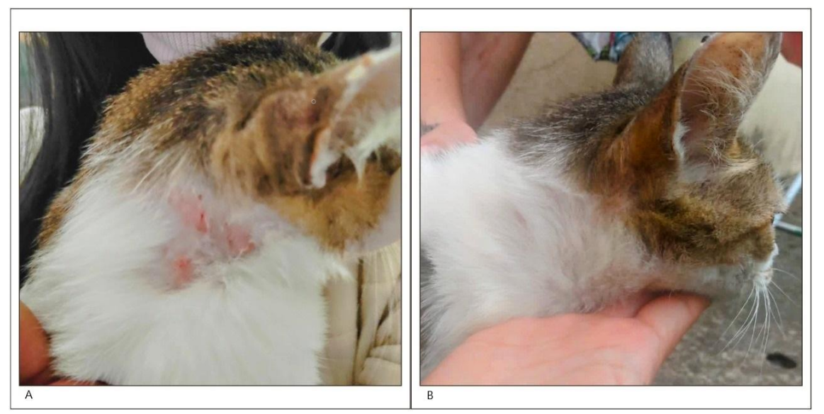
Figure 1 (A) and (B) - On the left, patient on the day of initial consultation, presenting alopecia with erythema and excoriations in the right lateral cervical region. On the right, lateral cervical region 72 days after completion of the proposed therapeutic protocol.

The parasitological examination of the skin scraping of the lesion did not show mites, however different stages (adults and eggs) of Demodex sp. were seen in the cerumen. Otological cytology showed cocci bilaterally. In fungal fur culture the species Microsporum sp., Cladosporium sp. and Aspergillus sp. were isolated, and in bacterial culture of otologic secretion, Staphylococcus spp. and Bacilus cereus .