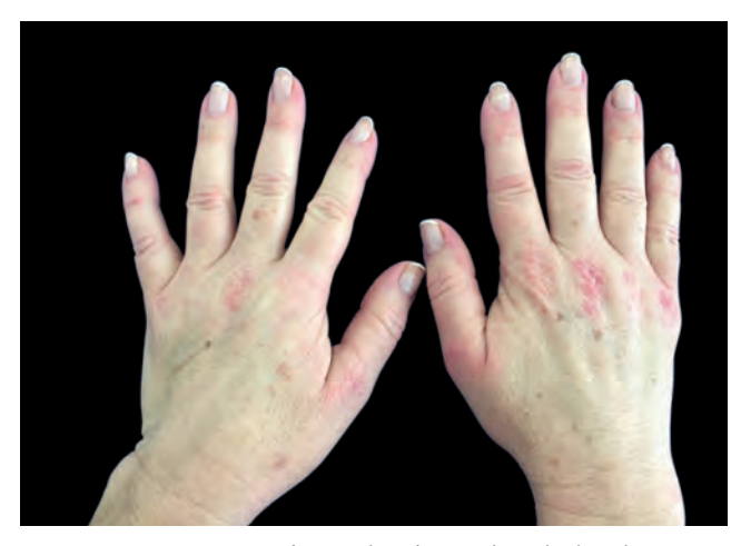
Figure 2: Gottron's papules observed on the hands