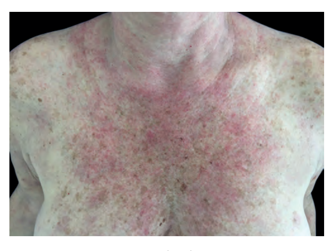
Figure 3: Shawl sign

pulmonary condition and cutaneous lesions.