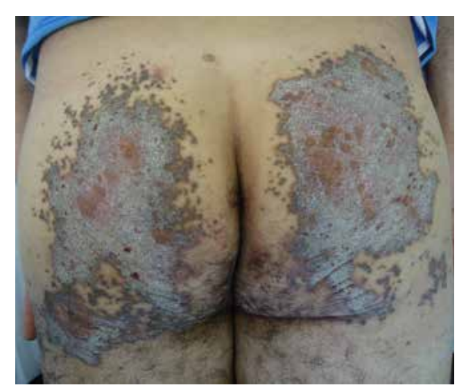
FIGURE 1: Gluteal lesions characterized by hyperkeratotic plaques