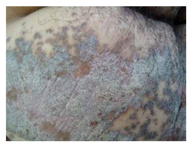
FIGURE 2: Detail of the periphery of the lesion in the left gluteus