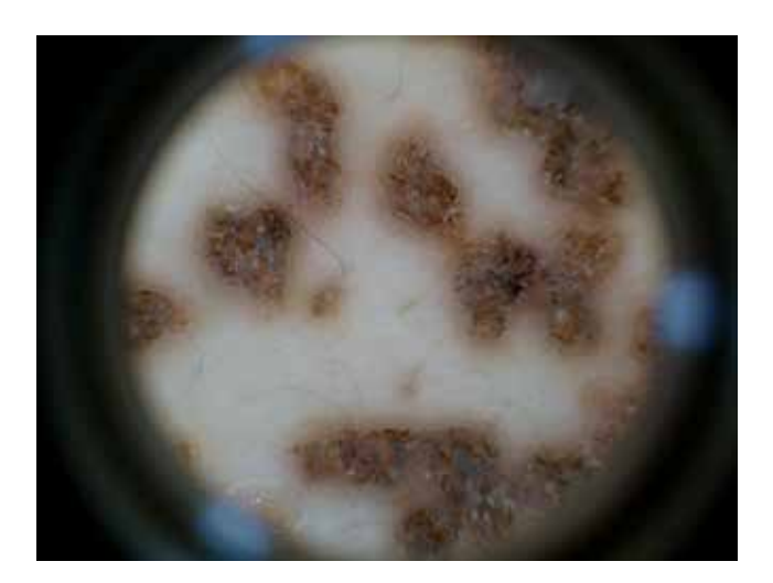
FIGURE 3: Contact dermoscopic examination in polarized light showing hyperkeratosis and well-defined edge