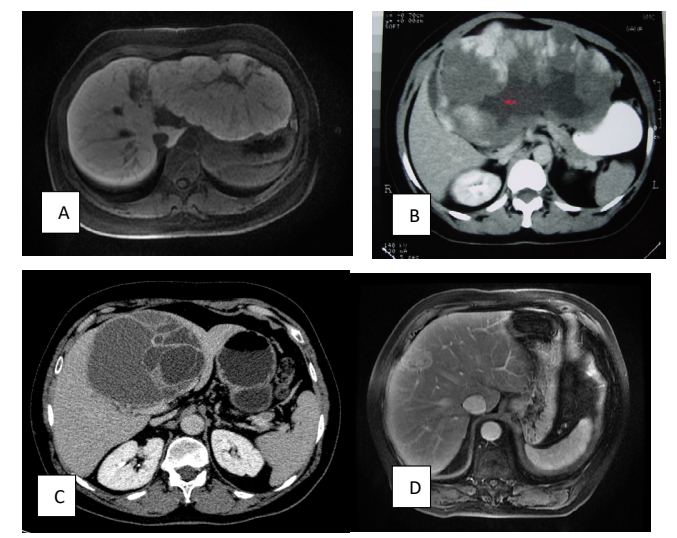
Figure 1 - Typical radiological findings for the diagnosis of: symptomatic focal nodular hyperplasia on the left lateral section compressing the stomach (A); symptomatic hepatic hemangioma on the left lateral section compressing the stomach (B); biliary mucinous cystic neoplasm on segment 4 of the liver (C); and AML between segments 4 and 8 (D).

The improvements in diagnostic tools during the last few years led to an increase in the detection of benign liver tumors. In addition, more accurate diagnoses became possible, allowing liver surgeons to understand the behavior of these