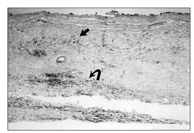
Fig. 2 - Photomicrograph of the pericardium removed during surgery showing thickening of the pericardium due to fibrosis intermingled with a mononuclear inflammatory infiltrate (dark spots, straight arrow) and with foci of hemorrhage (reddish spots, curved arrow). (HE, original magnification X6.3).

The surgical specimen revealed chronic pericarditis with fibrosis and fibrin deposits. Tests for bacteria or fungi were negative.