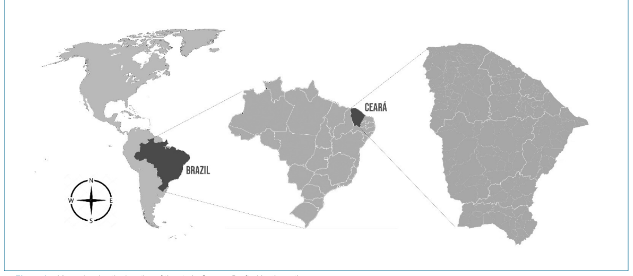
Figure 1 – Maps showing the location of the study.

The occurrence of ineligible donors due to CD was calculated, and a descriptive statistical analysis was conducted from the absolute and relative frequencies. For the epidemiological characterization of individuals who are blocked from donating blood due to a confirmed diagnosis of CD, the following parameters were considered: gender (male and female), age range (18 – 29 years of age and over 30 years of age), profession, hometown, and city from which the individual came (Fortaleza or other municipality). The descriptive analysis was performed using Microsoft Excel, version 2013.