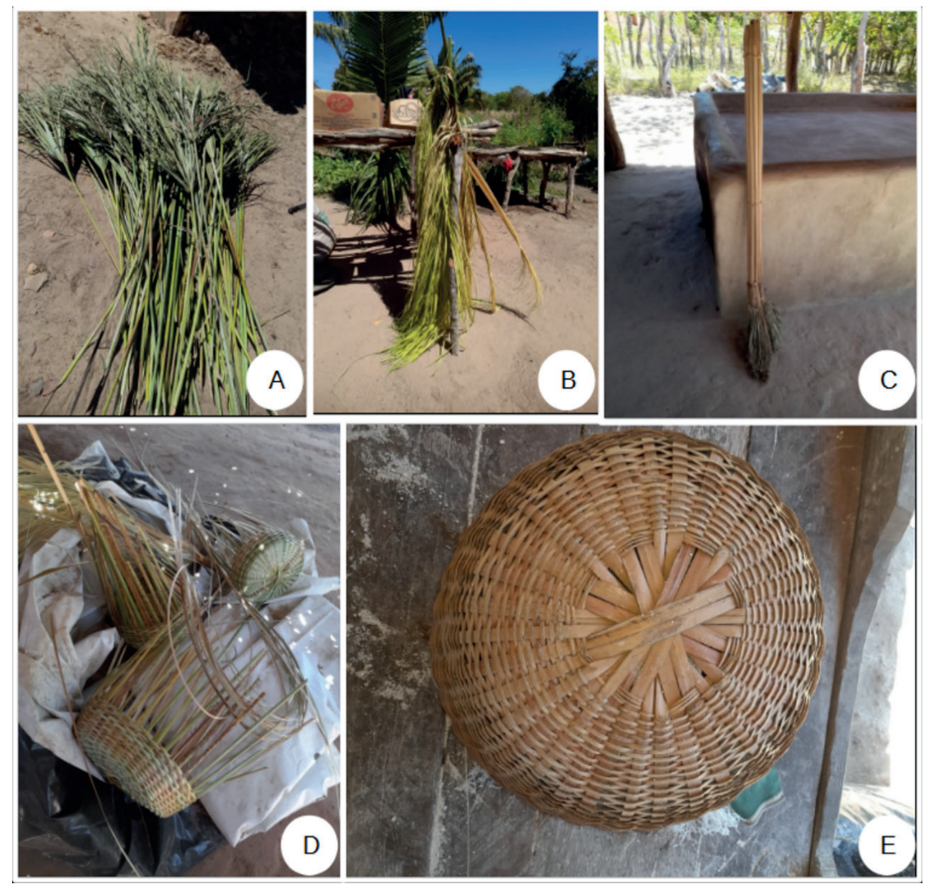
Figure 2. Processing of Buriti leaves for making baskets by the community of Brejo da Conceição in the municipality of Currais, Piauí, for ( A ) buriti leaves, ( B ) community man collecting the resource, ( C ) drying the fibers, ( D ) basket braiding, ( E ) basket production.

The association between categories of use and socioeconomic factors found that gender, age, and the number of people in homes have a positive relationship with the number of plants known for medicinal purposes. Regarding gender, the number of medicinal plants mentioned by women was higher, differing significantly from the amount mentioned by men according to contrast analysis. The timber use of plants showed a positive relationship with the number of residents, being quite significant. The gender also presented a relationship and influenced the number of known plants. Contrast