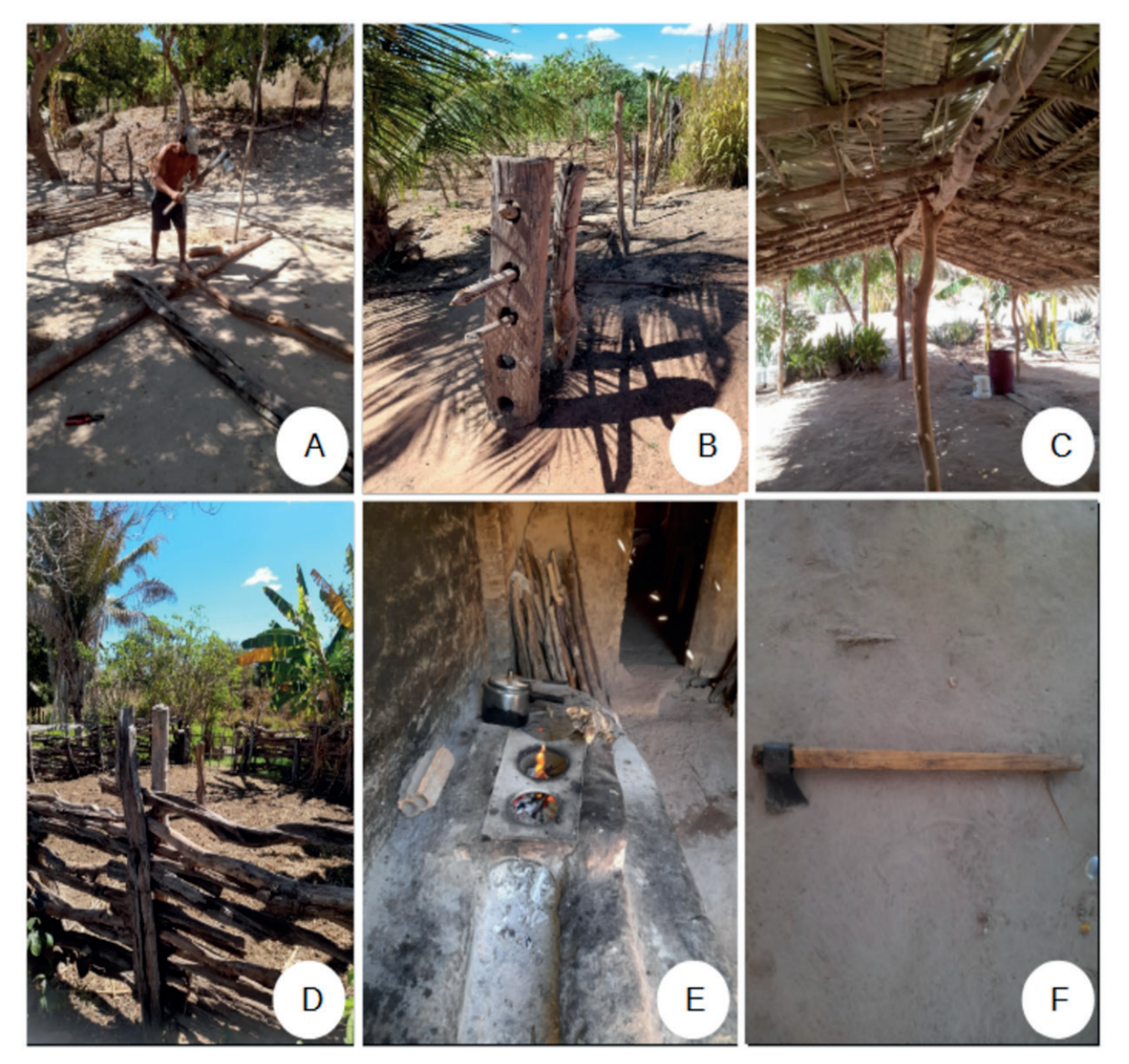
Figure 3. Use of wood resources by the Brejo da Conceição community in the municipality of Currais, Piauí, for ( A ) resident preparing wood for home construction, ( B ) fence, ( C ) roof, ( D ) corral, ( E ) firewood and ( F ) cable of axe.

In the community, six species had the highest cultural and relative importance values, being identified as frequently consumed species and with various uses in the community. Among these uses, the medicinal and food use of the buriti palm tree ( M. flexuosa L.f.), orange ( C. sinensis (L.) Osbeck) and cashew ( A. occidentale L.) plants, in the wood and medicinal use, the catinga de porco ( T. brasiliensis (Cambess.)