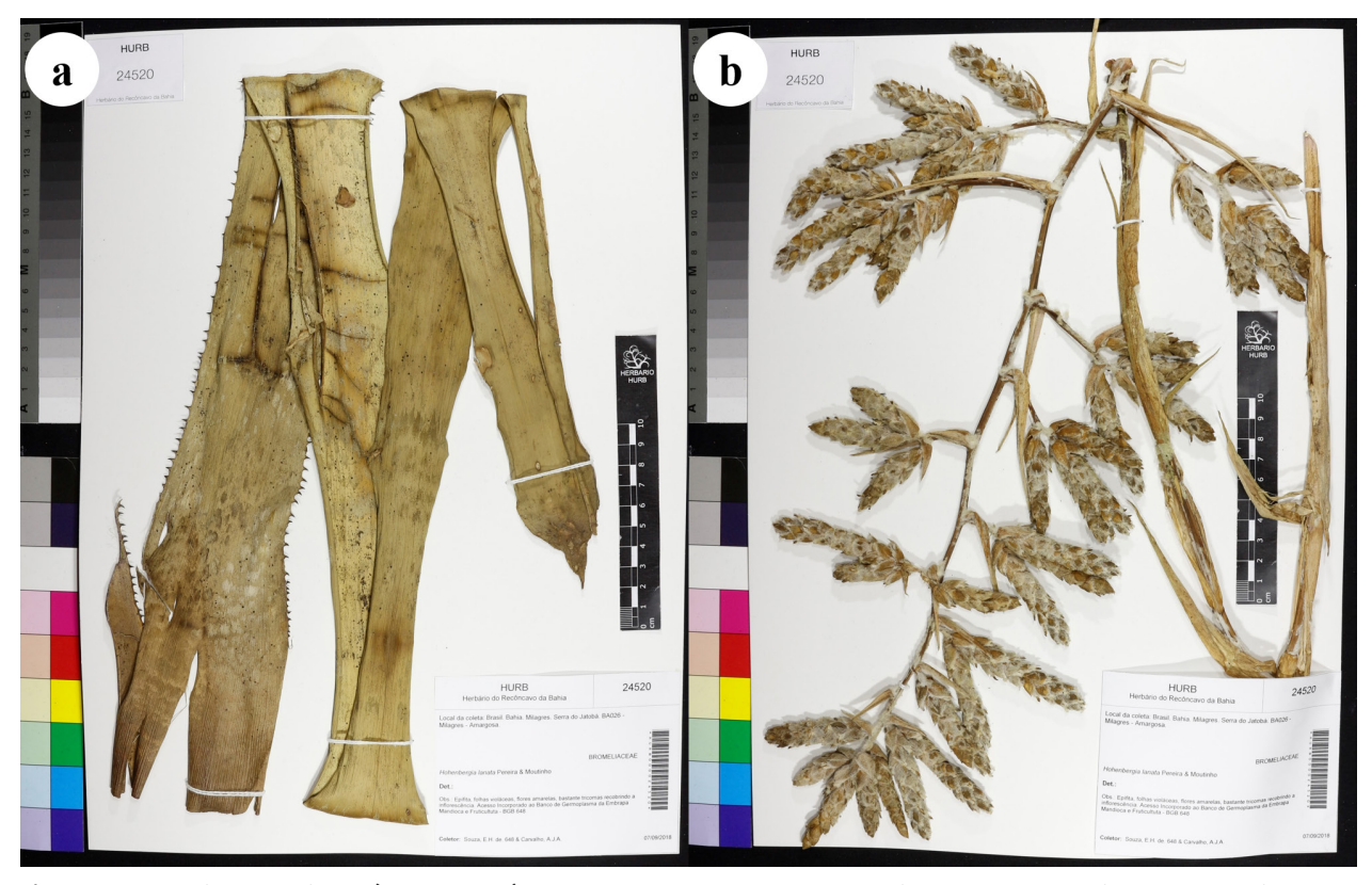
Figure 2. Herbarium specimen (HURB24520) from the recently found population of Hohenbergia lanata Pereira & Moutinho emend . B.P. Cavalcante, E.H. Souza, A.P. Martinelli & L.M. Versieux. a) Leaf. b) Inflorescence.

sepals; sepals 1.1-1.3 x 0.8 cm, triangular with an acute apex, partially free from each other, with lateral wings on both sides that exceed the mucro, margins smooth, whitish; petals 1.6-1.8 cm long, distinctly yellow, erect and spatulate, free from each other, with the petal appendage reaching half of the length of the petal; stamens included, 1.3–1.4 cm long, shorter than the petals; filaments 1.1–1.2 cm long, whitish, partially adnate to petals; anthers 0.2-0.3 cm long, yellowish; style ca. 1.4 cylindrical, whitish; stigma conduplicate-spiral, higher than anthers and shorter than the petals; ovary ca. 0.3 x 0.5 cm diameter, slight pyramidal, dorsal side rounded, axile placentation restricted to the apical portion of the locule; ovules numerous, caudate. Fruit berry, ca. 2 cm long, cylindrical to pyramidal, whitish, indument persistent, blue