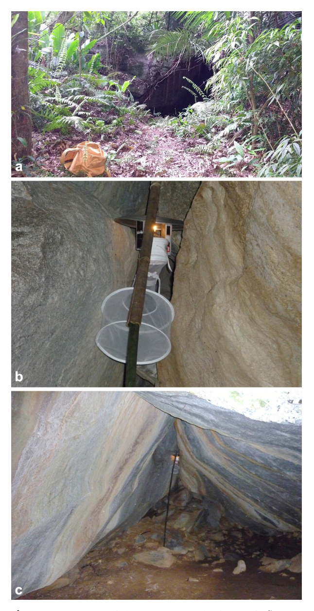
Figure 2. Entrance of the cave, near the base of São Caetano Rock, where the phlebotomine sand fly collections were made (a). CDC-type light trap between the rocks inside the cave (b). In detail, CDC-type light trap, between the rocks inside the cave (c).

its summit, while the surrounding area is characterized by typical forest vegetation. It is located 3 kilometers away from the city center. The collections were conducted within a cave named "São Caetano," its vicinity, and a forest in